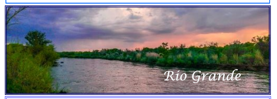
2015 West Sector Source of Supply Water Quality Table (page 6)

The West Sector's drinking water supply meets the federal drinking water standard of 10 ppm for nitrates. Nitrates have been detected in some of the City Wells up to 6.7 parts per million (ppm). Nitrate in drinking water at levels above 10 ppm is a health risk for infants of less than six months of age. High nitrate levels in drinking water can cause blue baby syndrome which is a potentially fatal blood disorder in which there is a reduction in the oxygen caring capacity of blood. Nitrate levels may rise quickly for short periods of time because of rainfall or agricultural activity. If you are caring for an infant, you should seek advice from your health care provider concerning nitrate in drinking water.